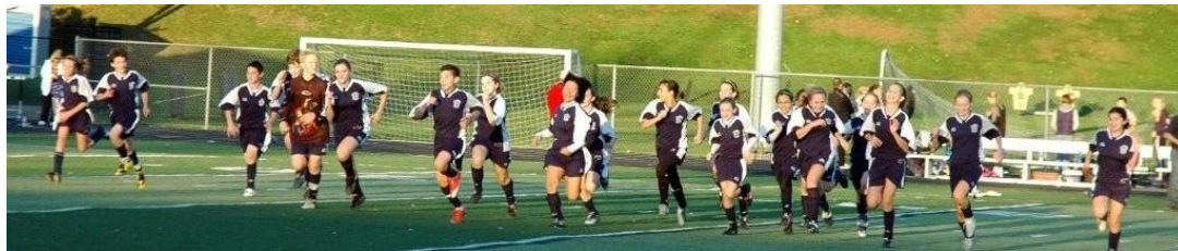
Varsity Team is World Cup Division - 1st Place Section III - Undefeated Champions!