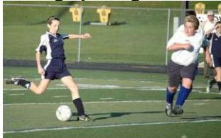
Setting up her goal

During the weekend of the DSL Play-Offs, St. James will have all 4 soccer teams represented including the 3rd and 4th grade teams, and the JV and Varsity teams. This means that approx. 60 of your fellow SJS student-athletes will be there to compete in their respective playoff categories. In the history of the soccer program at SJS.....we have never had that many teams participating in the DSL Playoffs at the same time. GO COUGARS!