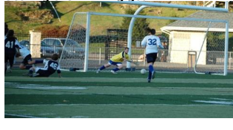
Scoring the winning goal

The Cougars ended the regular season with 8 Wins and no losses which makes them the Section III Champions and the #1 Seed in the World Cup Division for the Diocese Soccer League Playoffs. Congratulations Cougars!! The DSL Playoffs will be held the weekend of November 7 - 8 at Youthtowne. Watch for more information as we get closer so that you can come out and cheer on the Cougars.